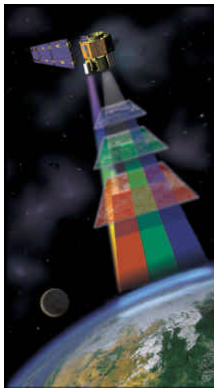
A New Millennium Program mission called Earth Observing 1 will test new imaging technologies that will help us understand changes (such as the disappearance of the rain forests) that affect the environment.

Can you draw any conclusions about the kinds of space environments where this material would or would not be suitable? Keep in mind there are no doubt environments out there that we haven't even begun to imagine!